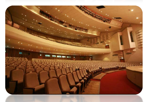
Concert Hall 백령아트센터