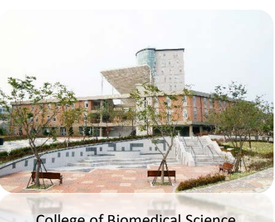
College of Biomedical Science 의생명과학대학