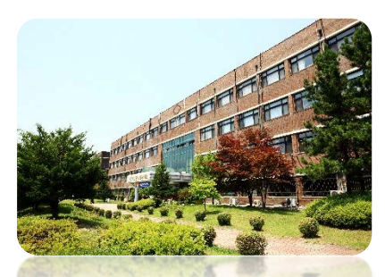
College of Animal Life Science 동물생명과학대학