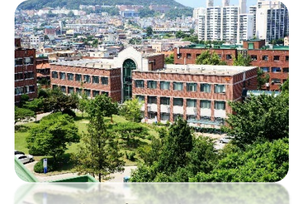
College of Natural Sciences 자연과학대학