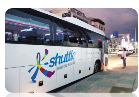
Free Shuttle Bus (Campus ⇔ Bus Terminal ⇔ Subway Station)