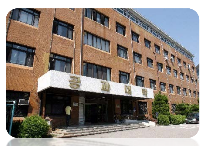
College of Engineering 공과대학